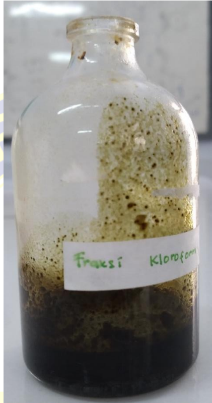
Gambar VI.1 Fraksi Kloroform buah Andaliman