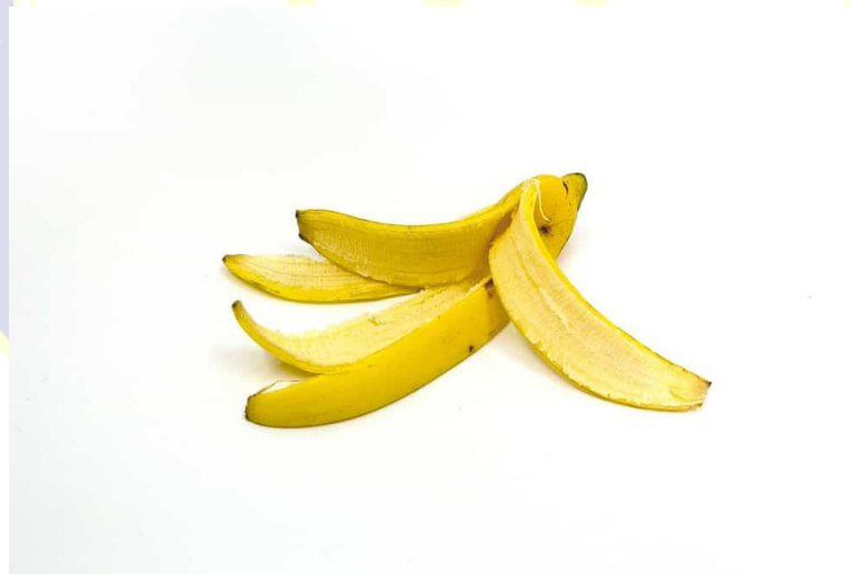
Gambar 4. Kulit Pisang ( Musa paradisiaca L.)