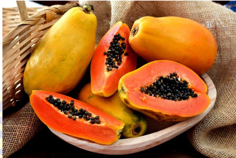
Gambar 3. Kulit Pepaya ( Carica papaya )