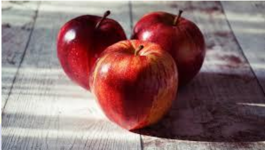
Gambar 1. Kulit Apel ( Malus domestica )