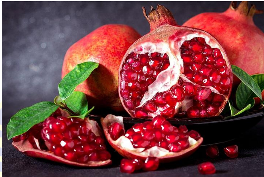
Gambar 5. Kulit Delima ( Punica granatum L.)