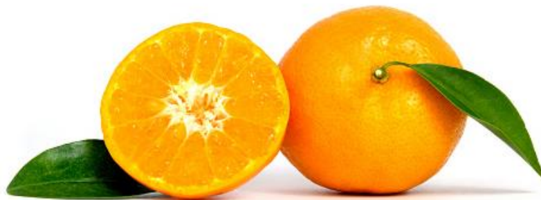
Gambar 2. Kulit Jeruk ( Citrus sinensis )